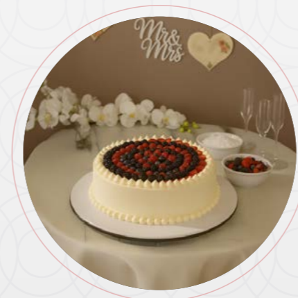
INTERACTIVE BERRY SYMPHONY